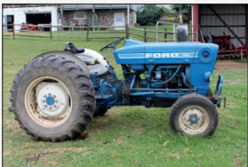
(tractor also shown on reverse side)

Terms: Cash, Pa. Check or credit card (4% service fee with credit card)